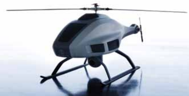
An example of Unmanned Aerial System