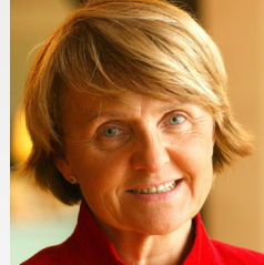
Danuta Hübner Member, European Parliament