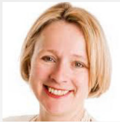
Vicky Ford Member, European Parliament

Vicky Ford was elected as Conservative Party Member of the European Parliament for East of England in the 2009 European Parliament election. She is the UK Conservative spokesman for Industry and Research, sitting on the Committee on Industry, Research and Energy and also has seats on the Committee on the Environment, Public Health and Food Safety and the Committee on Economic and Monetary Affairs.